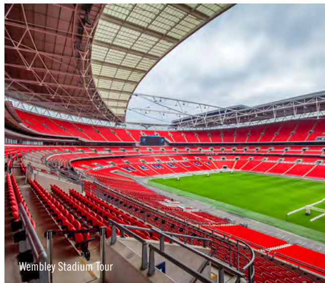
Wembley Stadium Tour